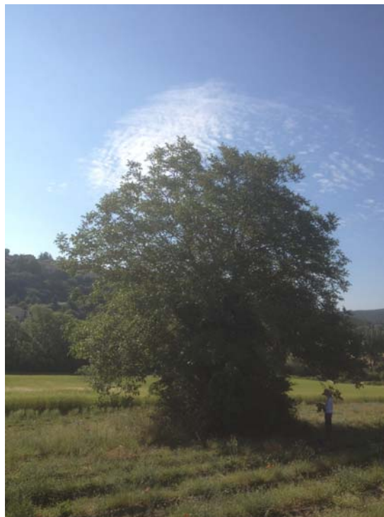
Field survey in Provence