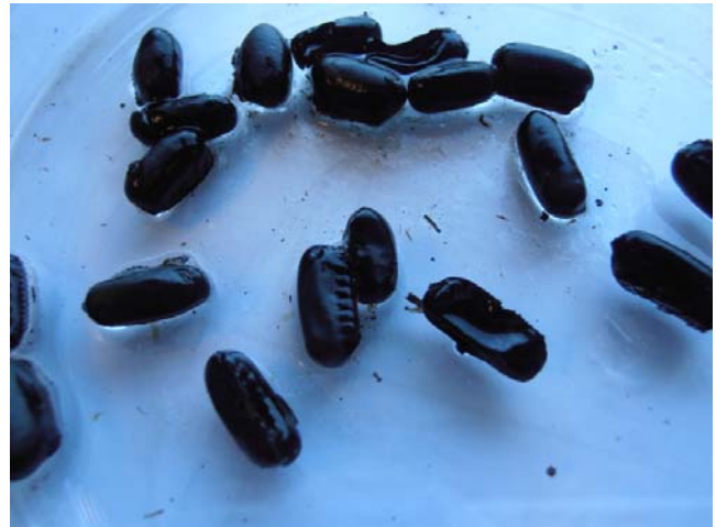
Insect puparia provisionally identified as cockroach oothecae

Initial assessment of the Bloomberg Place assemblage will continue well into 2014 and with numerous other large projects in the pipeline, the challenges will continue for the MOLA environmental team.