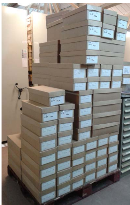
Boxes of bone from the Temple of Mithras site