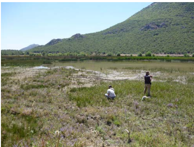
Collecting modern plant samples in Turkey

These are some of the questions being addressed by the Agricultural Origins of Urban Civilization (“AGRICURB”), a